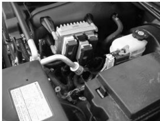
Fig # 6 installation complete

Have fun with your new power from JET Performance Products