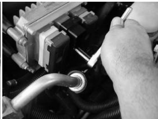
Fig # 4 tighten extender bolt